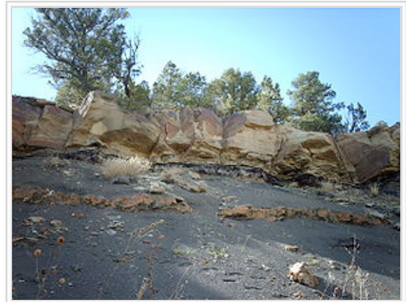
The K–T boundary exposure in Trinidad Lake State Park, in the Raton Basin of Colorado, USA, shows an abrupt change from dark to light colored rock.

The impact may also have produced acid rain, depending on what type of rock the asteroid struck. However, recent research suggests this effect was relatively minor. Chemical buffers would have limited the changes, and the survival of animals vulnerable to acid rain effects (such as frogs) indicate this was not a major contributor to extinction. Impact theories can only explain very rapid extinctions, since the dust clouds and possible sulphuric aerosols would