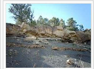
White line added to mark the transition.