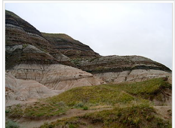
Badlands near Drumheller, Alberta where erosion has exposed the KT boundary.