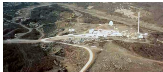
The Mauna Loa Observatory

Due to funding cuts in the mid-1960s, Keeling was forced to abandon continuous monitoring efforts at the South Pole, but he scraped together enough money to maintain operations at Mauna Loa, which have continued to the present day [5] alongside the monitoring program by NOAA. [6]