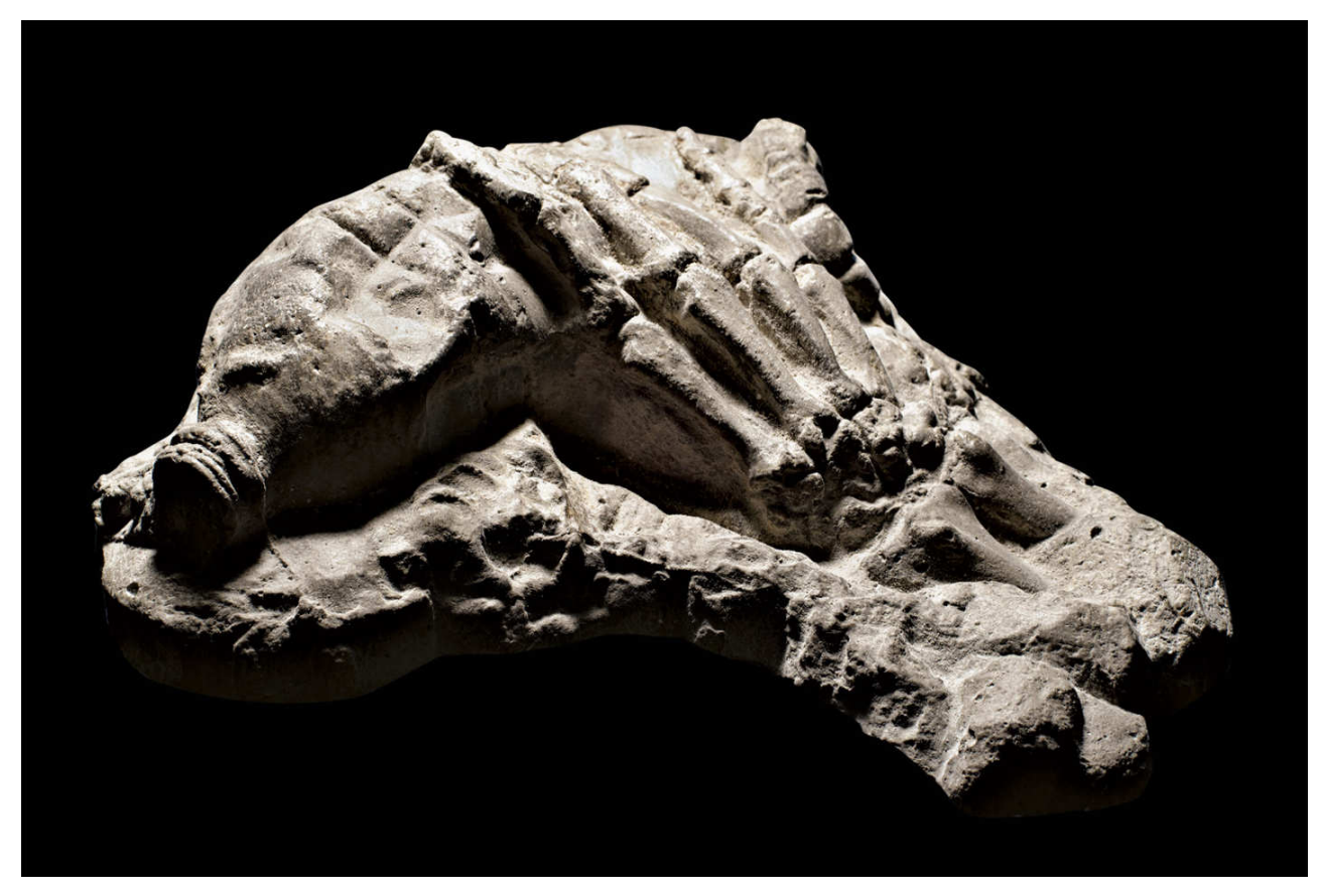
In the sugarcane region of El Salvador, as much as one-fifth of the population has chronic kidney disease, the presumed result of dehydration from working the fields they were able to comfortably harvest as recently as two decades ago.

Humans, like all mammals, are heat engines; surviving means having to continually cool off, like panting dogs. For that, the temperature needs to be low enough for the air to act as a kind of refrigerant, drawing heat off the skin so the engine can keep pumping. At seven degrees of warming, that would become impossible for large portions of the planet's equatorial band, and especially the tropics, where humidity adds to the problem; in the jungles of Costa Rica, for instance, where humidity routinely tops 90 percent, simply moving around outside when it's over 105 degrees Fahrenheit would be le And the effect would be fast: Within a few hours, a human body would be cooked to death from both inside and out.