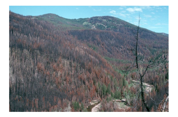
Fig. 2. Mixed-severity fires (fires that leave recognizable patches of low-severity, medium-severity, and high-severity effects) typify the majority of mixedconifer forest systems in the western United States. The brown-needled and blackened areas harbor unique sets of plant and animal species found in no other forest conditions. This photograph of the North Fork of the Blackfoot River was taken 10 months after the 1988 Canyon Creek fire in Montana. Many fire-dependent plant and animal species were present in the more severely burned areas until they were helicopter logged, suggesting that unburned forests might be a better alternative for timber harvest.