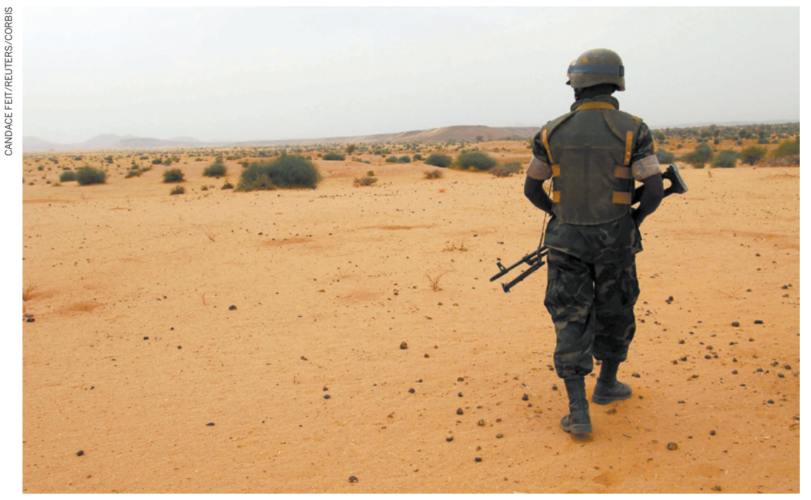
An African Union peacekeeper patrols after a rebel attack in drought-ridden Darfur, Sudan, in 2006.

DATA Handsome guide to visualizations should improve science graphics p.186